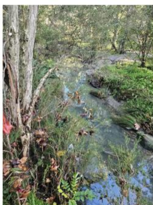
1 Site 1a – Downstream 20260621_095139