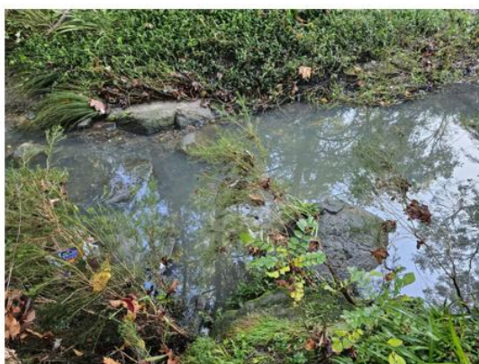
2 Site 1a – Instream 20260621_095117