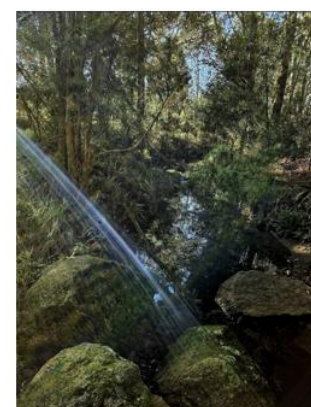
6 Site 1b – Upstream 20260621_100311