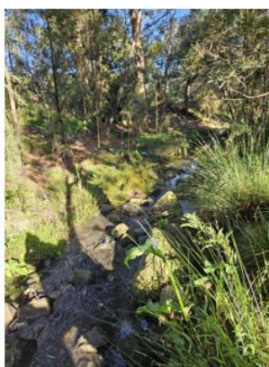
4 Site 1b – Downstream 20260621_100330