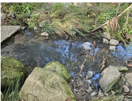
5 Site 1b – Instream 20260621_100317